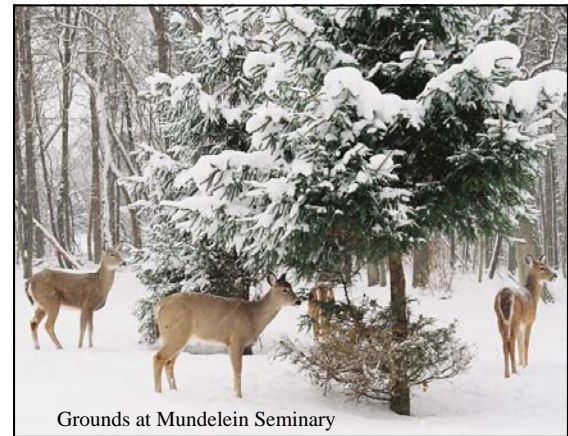
Grounds at Mundelein Seminary

EPW is an opportunity to learn more about diocesan priesthood. The retreat is held on the campus of Mundelein Seminary. The weekend includes Adoration Prayer, Mass, conversation with seminarians and faculty, and quiet time for reflection –all while enjoying the beautiful 1,000 acres of the Seminary grounds! The retreat begins at 7:30 p.m. on Friday evening and ends Sunday after lunch.