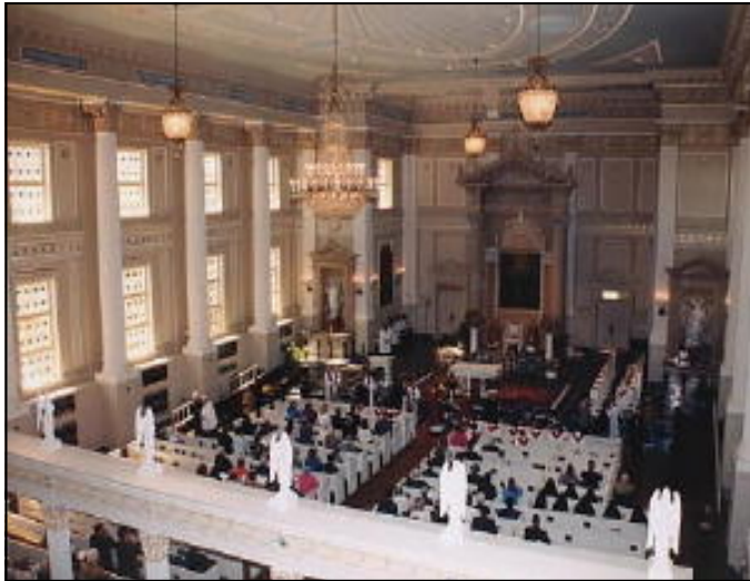
Chapel of the Immaculate Conception

EPW is an opportunity to learn more about diocesan priesthood. The retreat is held on the campus of Mundelein Seminary. The weekend includes Adoration Prayer, Mass, conversation with seminarians and faculty, and quiet time for reflection –all while enjoying the beautiful 1,000 acres of the Seminary grounds! The retreat begins at 7:30 p.m. on Friday evening and ends Sunday after lunch.